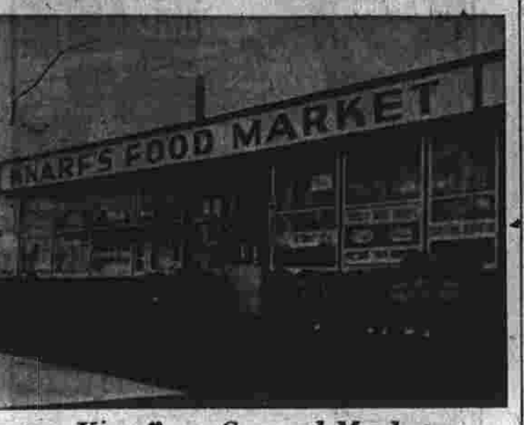
Knarf's, a General Market

Alembers Now York Stock Exchange 913 Main Street, Manchester - Mitchell 3-1571